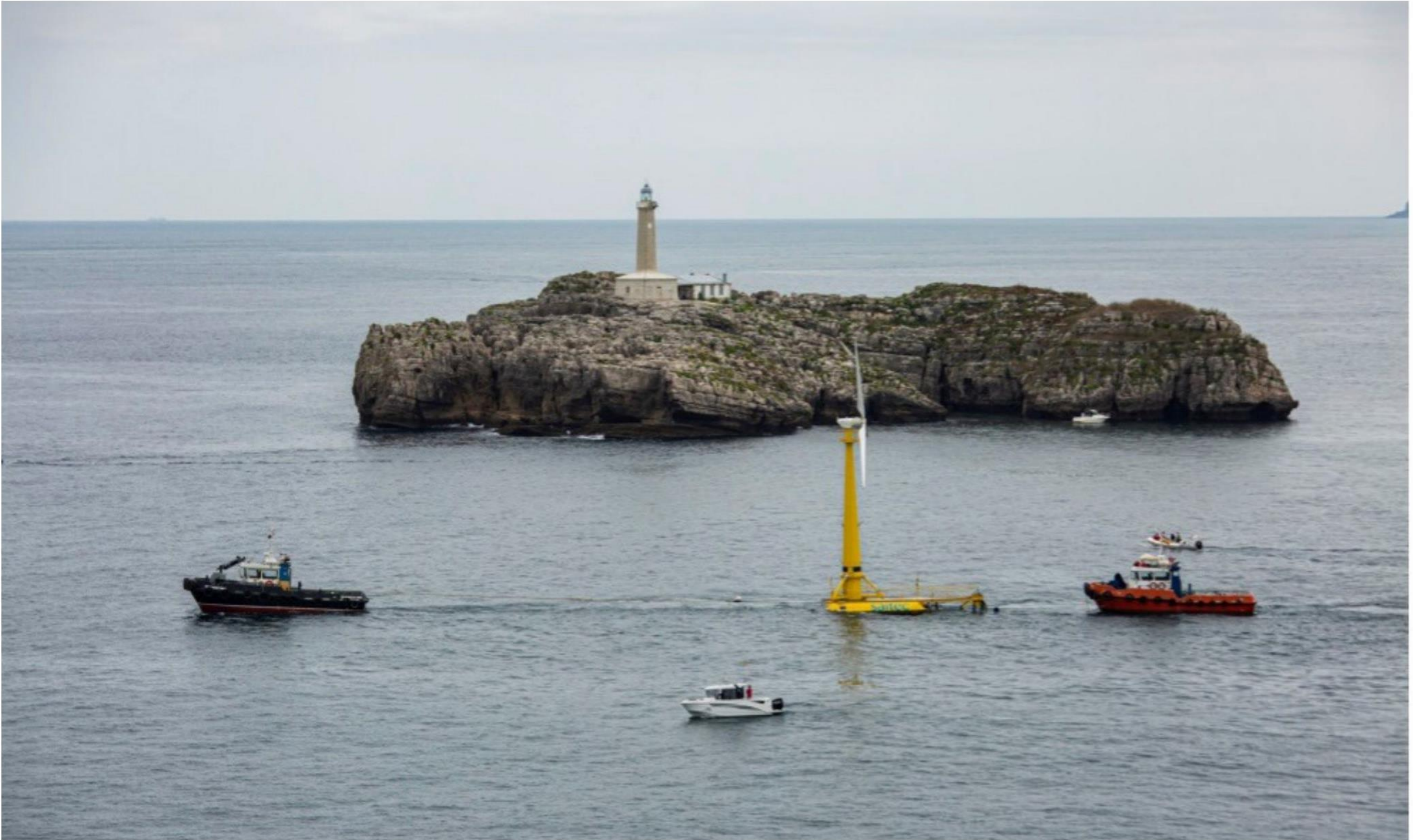
FIGURE 3: BLUESATH FLOATING WIND PLATFORM. 1:6 SCALE PROTOTYPE