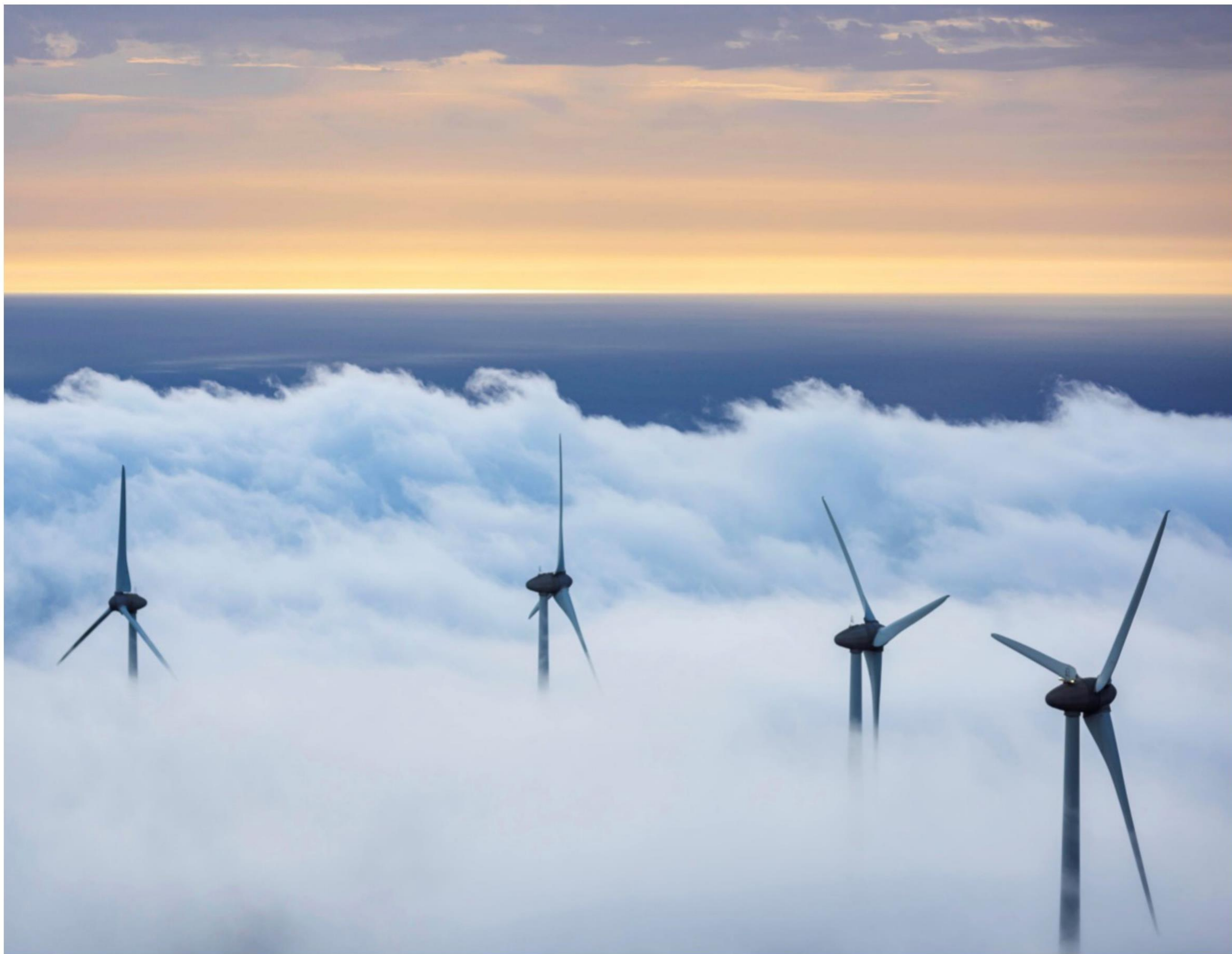
WHY WE ARE SUSTAINABLE?