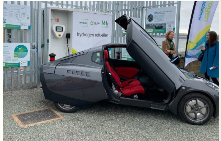
Riversimple RASA hydrogen fuel cell electric car

as remotely operated vehicles, digital twins, cable arrays, and sensors. They now demonstrate their technologies to major stakeholders such as Equinor and EDF Renewables.