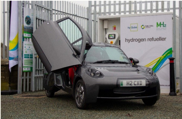
Riversimple RASA hydrogen fuel cell electric car