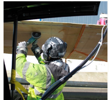
Damage detection sensor tests

Eleven-I (UK) and Innvotek (UK) are working with GE Renewable Energy and ORE Catapult on robotic solutions as part of the 'Stay Ashore' R&D programme and delivered through the Offshore Wind Innovation Hub's Innovation Exchange (OWiX) in partnership with KTN. Both companies receive technical support, guidance, and