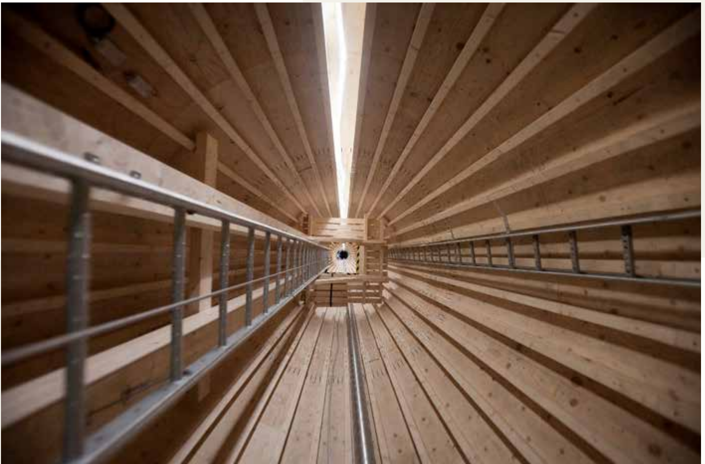
Inside view of the 30 m wooden tower from Modvion on Björkö (Gothenburg) (Source: Modvion).

of 100 m. In June 2021, the corporate venture capital arm of Vestas, Vestas Ventures, have made a new investment in Modvion through a recent directed share issue to strengthen its engagement and support to Modvion. In May 2022, Modvion inaugurated the world's first factory for wooden wind turbines in Gothenburg.