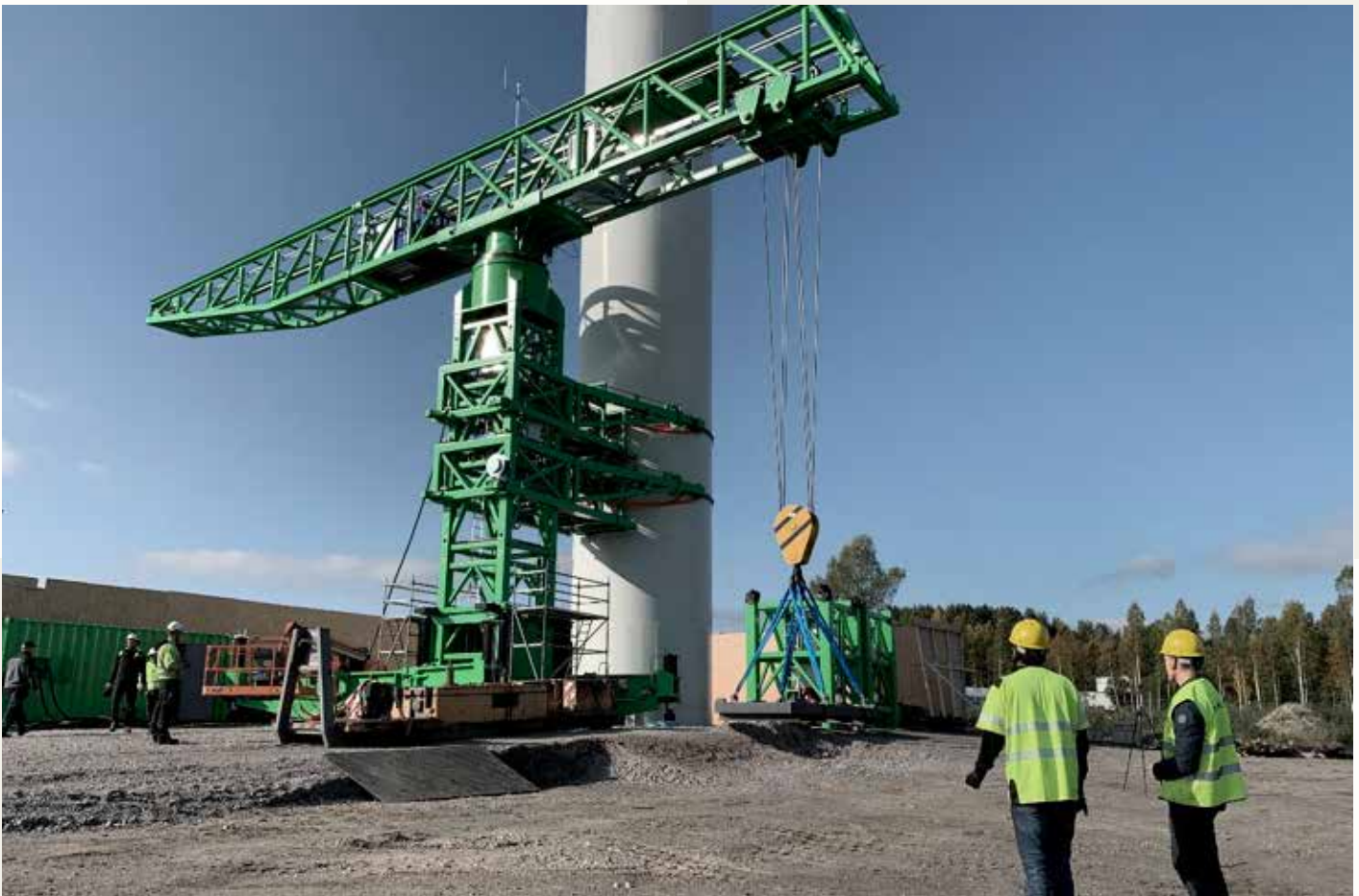
S&L Access Systems, Salamander Quick Lift Crane prototype.

the winter of 2021/22, electricity prices have been unusually high in Sweden and varied greatly throughout the day. Even in the north, where electricity normally costs between 5$ and 60$ per MWh, consumers have been hit by electricity prices up to 400$ per MWh. The increased electricity prices can be explained by two main reasons: Sweden's electricity network is closely connected with our neighboring countries and other countries down on the continent. This means that prices in Sweden are affected by temporary high energy prices seen in the rest of Europe. The second reason is the unusual weather. After a mild autumn and temperatures above normal throughout Sweden in October, the winter suddenly hit at the end of November. It caused the ice to settle simultaneously in several of our large rivers. As a result, total production from hydropower tem-